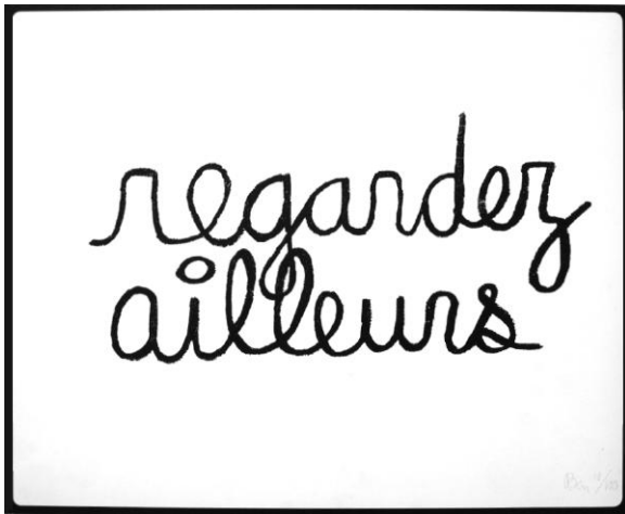
Print – Poster Lithograph Size: 54 cm x 65 cm