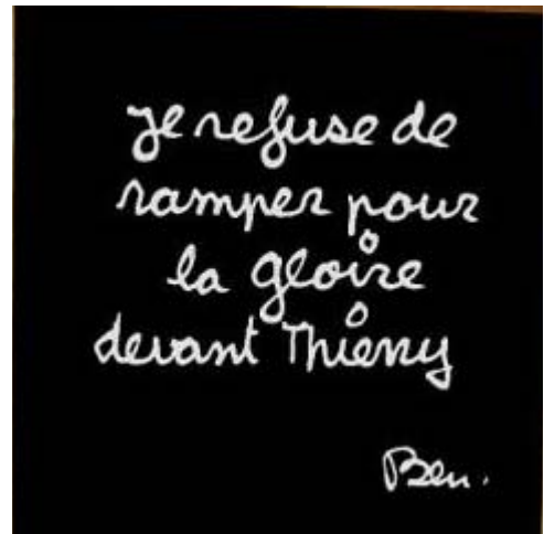
Painting Created: 2005 Size: 70 cm x 70 cm