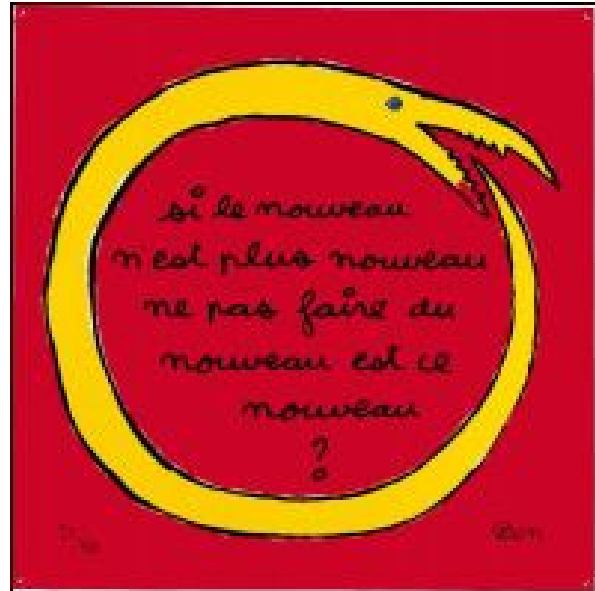
Art d'aptitude de Ben 50 copies Created: 1986 Size: 100 cm x 100 cm