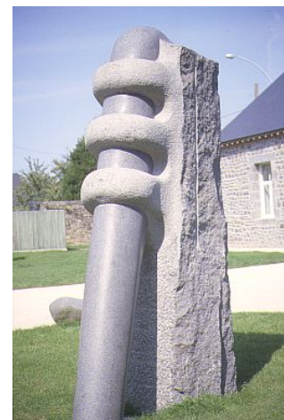
"Le tricot de la Terre"