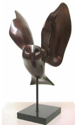
Little Owl Bronze