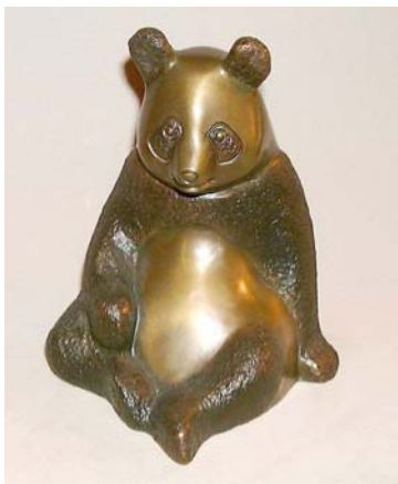
Bear Bronze Created in 1997