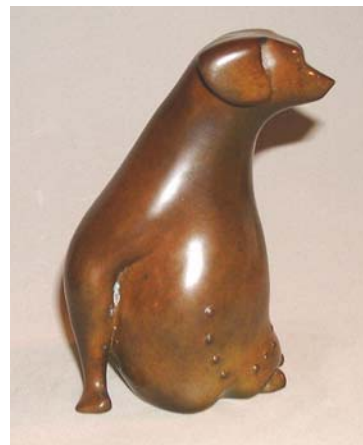
Dog Bronze Created in 1998