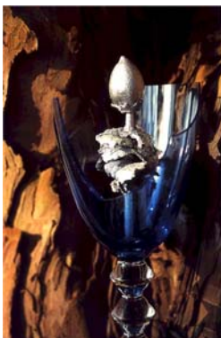
"Hadra". Detail of a group composed of 9 Mutation glasses