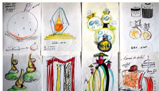
Perfume bottle sketches