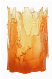
"Corinthe" - 275 copies H: 38.5 cm

"Corinthe" is a massive sculptural piece evoking the bark of a tree. It was created in September 2005 in an edition of 275 copies, forming an important item in the Daum Design collection. Here we find impressive work on the thicknesses, which create an effective play with light.