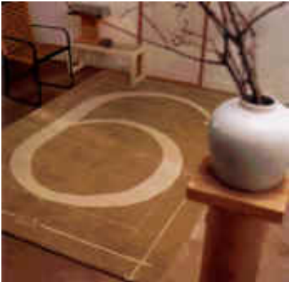
Building six Carpet Size: 170 x 270