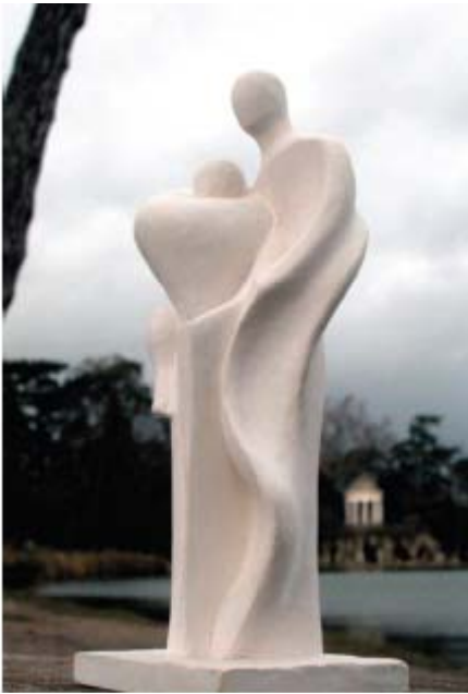
Roi et Reine (King and Queen) – Marble