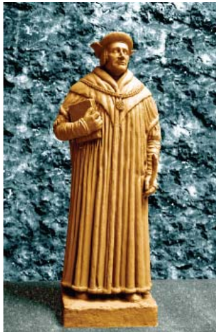
Thomas More – Study in glass