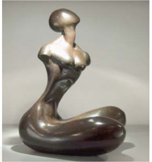
Femme assise (Seated woman)