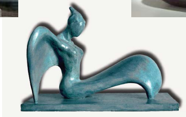
Ange assis (Seated angel)