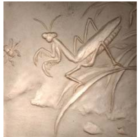
Au bord de l'eau (By the water's edge) - Clay