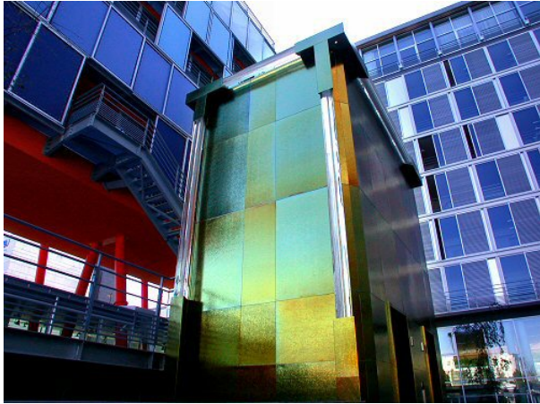
EMPREINTE DE LUMIERE