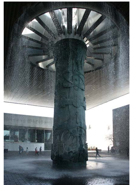
National Museum of Anthropology and History (Mexico City)